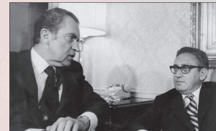
Richard Nixon and Henry Kissinger

The National Security Study Memorandum 200 documents U.S. policy of depopulation.