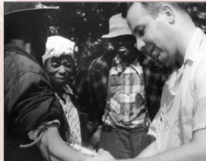
The Tuskegee Syphilis Experiment

The U.S. Government conducted The Tuskegee Syphilis Experiment on Black men without their knowledge or consent; the U.S. also sponsored unethical syphilis experiments on the Guatemalan people.