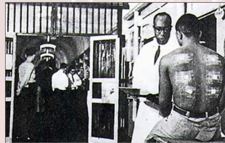
Panel suggests using inmates in drug trials.

U.S. colonists, led by British commander Sir Jeffery Amherst, purposely gave Native Americans blankets infected with smallpox in the early 1760s.